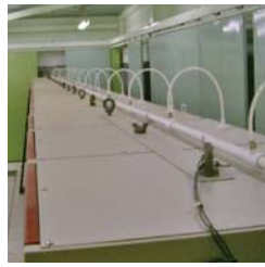
Capillary tubes branch off the main VESDA sampling pipe and into the equipment cabinet, allowing the earliest possible warning of smoke within the cabinet.