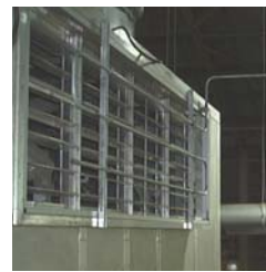
Sampling across the fresh air make-up vent can be used to prevent the introduction of external pollutants, and to prevent internal detectors from issuing false alarms.