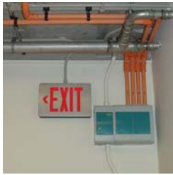
In small facilities one VESDA detector can be used to protect several areas e.g. ceiling, return air vent and under the floor.

The most effective use of a VESDA system to protect a datacom facility, is to install sampling points near the most likely sources of electrical fire, and along the path that smoke will be carried by air-conditioning. The VESDA Datacom Design Guide should be consulted when designing and specifying VESDA ASD systems.