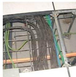
VESDA sampling pipe should be installed under the restricted area of the raised floor and near high-risk cabling, this enables early detection of any smoke in that space.

NB: All designs should be tested to comply with VESDA Design Guide recommendations and local codes and standards.