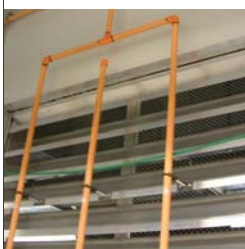
Smoke in an air-conditioned room travels with the airflow to the return air vent, rather than to the ceiling. VESDA sampling pipe can be installed across the vent to detect smoke early.