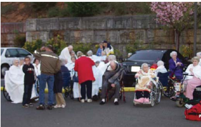
The cost, complexity and inconvenience of evacuating the elderly and frail is best avoided, especially in the event of a nuisance alarm.