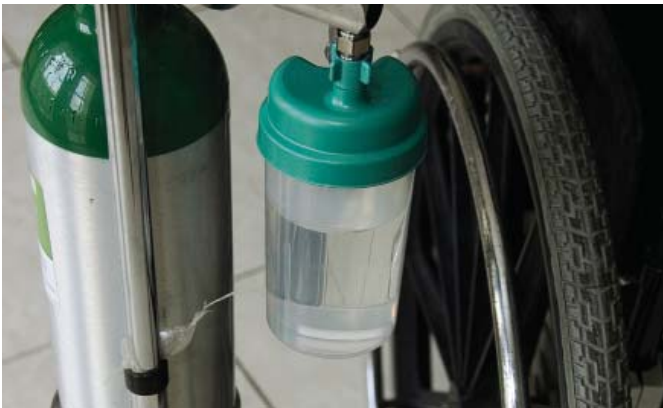
The hidden fuel load in a hospital is significant. Consider the distribution of bottled oxygen throughout the facility.